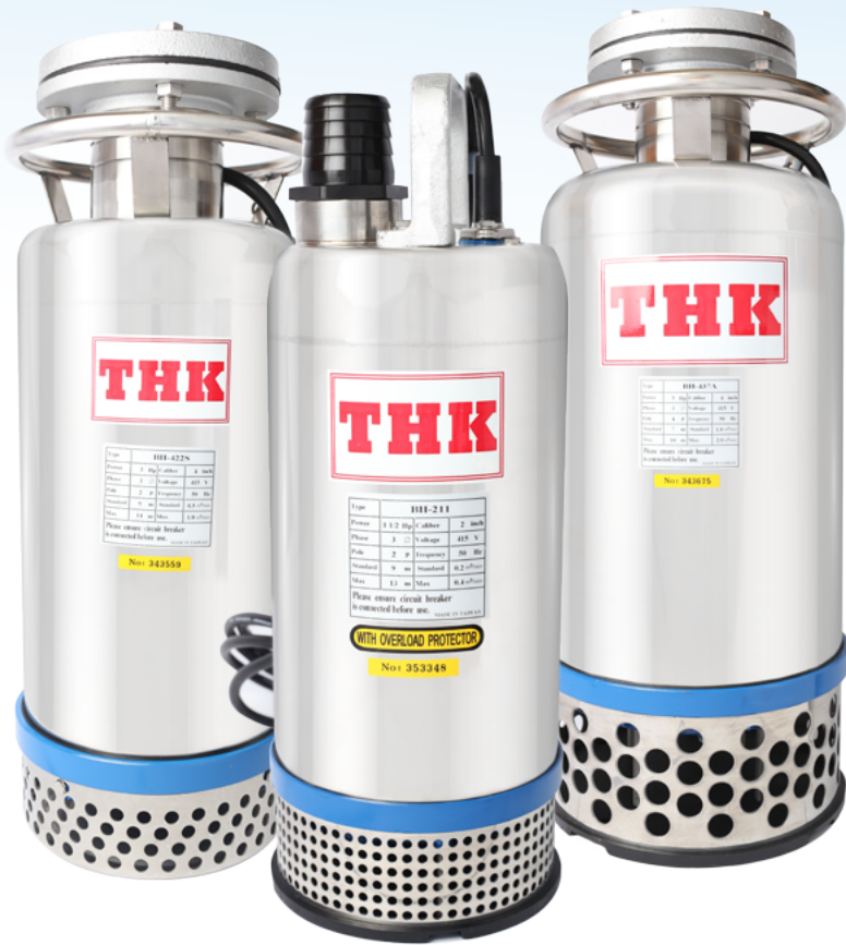
SUBMERSIBLE PUMP BH & BH S-SERIES