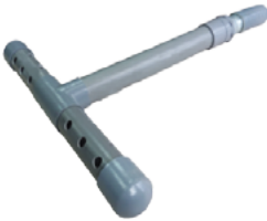
PVC Tee Socket Pipe 3" (2FT X 5FT)