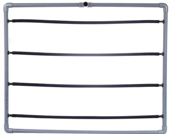
Air Diffuser Grid