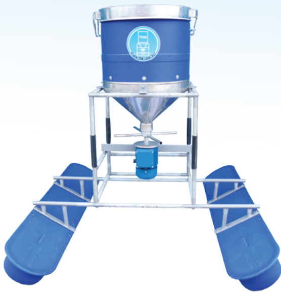
AFF 75H - THK Autofeeder HDPE tank with floater