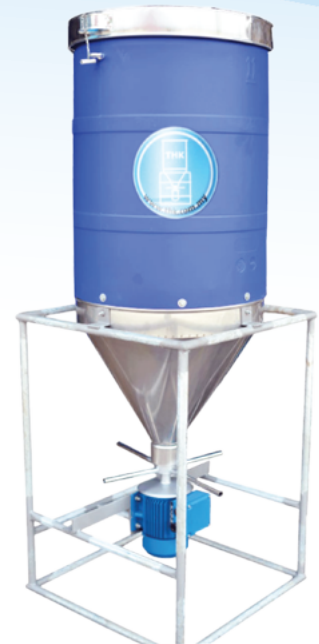
AF 150H - THK Autofeeder HDPE tank (CPF standard)