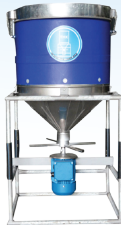
AF 75H - THK Autofeeder HDPE tank (CPF standard)