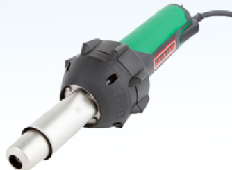
Hot air hand tool-TRIAC-ST