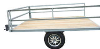
Kubota Trailer 1.5m X 2.7m