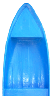
Fiber boat (8ft)