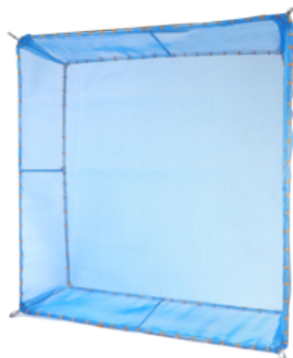
Feeding tray with net