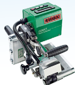
Hot Wedge Welder-COMET