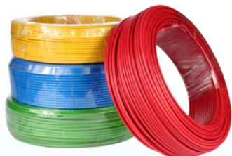
PVC Cable Single Core